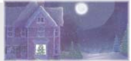
Scene of Kent during March's Meeting