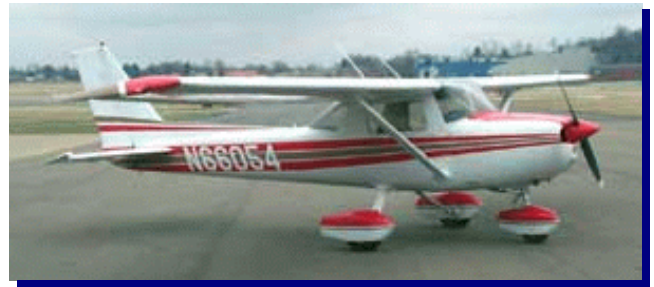
One of American Winds 150 ready for flight