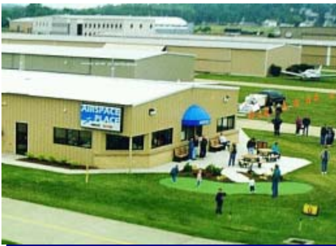
AirSpace Place.....home for the progressive dinner