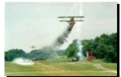
The Rhinebeck Airshow