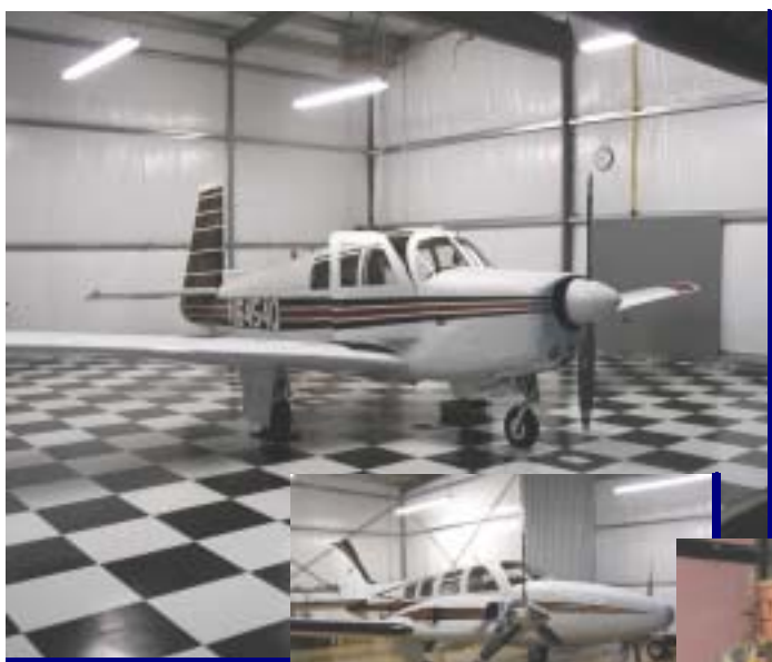
The disco hangar floor