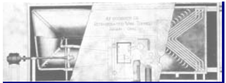
BF Goodrich severe weather test tunnel

The most recent contribution to the aeronautic industry to permit flying under exceptionally hazardous weather conditions is the Goodrich rubber "wing shoe" for the prevention of ice formation on the leading edges of wings, wires, struts, propellers, and landing gear. This new rubber covering operates automatically and is designed around small rubber tubes which inflate and deflate within the special rubber sheets on the airplane. This expands the surface upon which ice usually forms and prevents its adhesion on the leading edges.