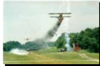
The Rhinebeck Airshow