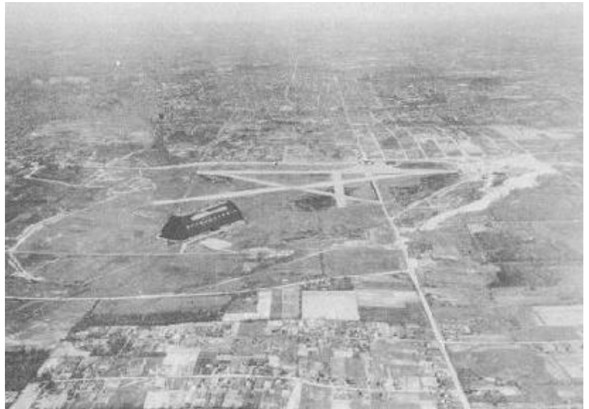
Akron Municipal Airport from the air. Year ?

Ground Transportation: taxicabs available; but on hourly schedule.